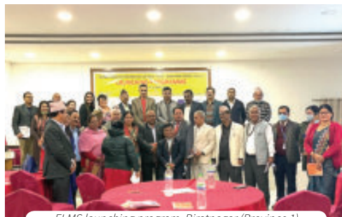
ELMS launching program, Biratnagar (Province 1)