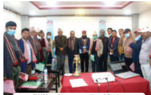
ELMS launching program, Karnali Province