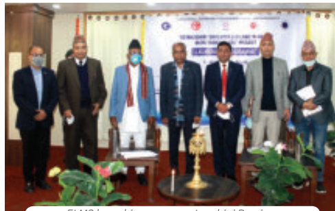
ELMS launching program, Lumbini Province