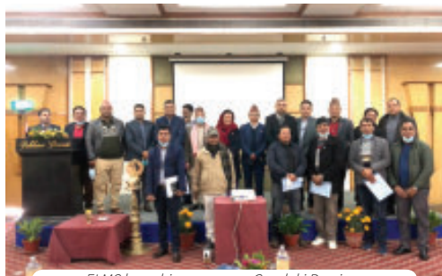
ELMS launching program, Gandaki Province