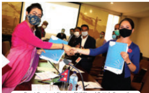
Grant Contract Signing FNCCI and British Council