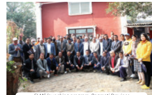
ELMS launching program, Bagmati Province