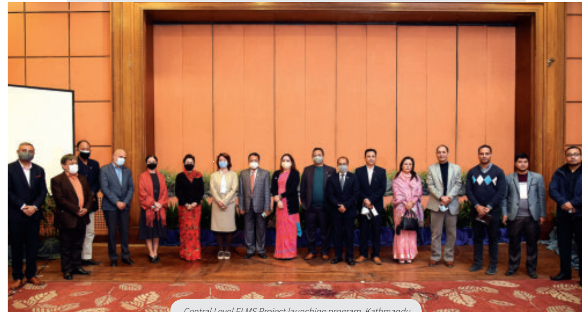
Central Level ELMS Project launching program, Kathmandu

"Establishing an Employer led Labour Market Secretariat (ELMS)" Project in joint implementation of