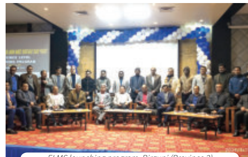
ELMS launching program, Birgunj (Province 2)