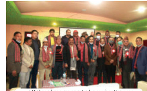
ELMS launching program, Sudurpaschim Province